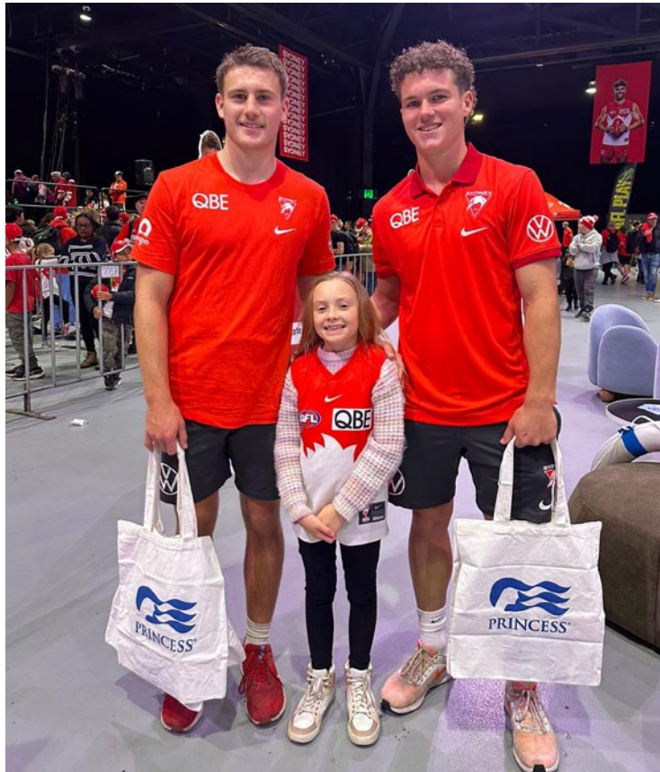
Swans' home opener against the Melbourne Demons at the SCG, with the home team winning 84 points to 64.

Princess earlier in the year took a number of trade partners to the