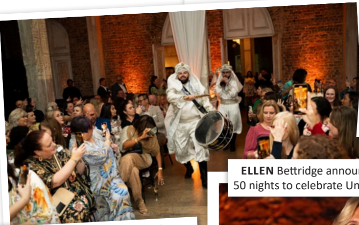
EGYPTIAN entertainment welcome.