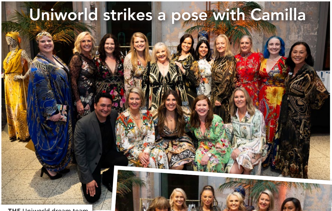
THE Uniworld dream team.