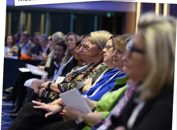
THE Cruise360 audience looks on intently during one of the many fascinating panel sessions.