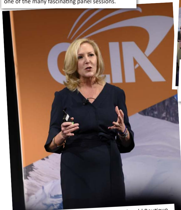
ELLEN Bettridge, President and CEO of Uniworld Boutique River Cruise Collection/U River Cruises, provides insight into the emerging Generation Z market.