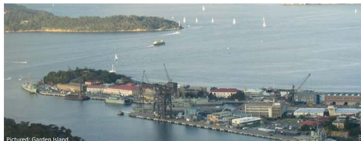
Pictured: Garden Island.

Navy only uses the eastern side of Garden Island, claiming there is "no reason why" the Federal Government couldn't relocate ships to the western side of the island as they did until the 1980s.