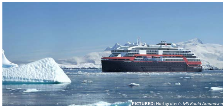
PICTURED: Hurtigruten's MS Roald Amundsen .

The updated sustainability guide states that EGCS has been