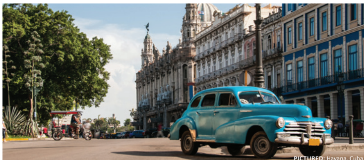
PICTURED: Havana, Cuba.

The fallout has seen Royal Caribbean Cruises announce immediate itinerary changes on sailings departing this week,