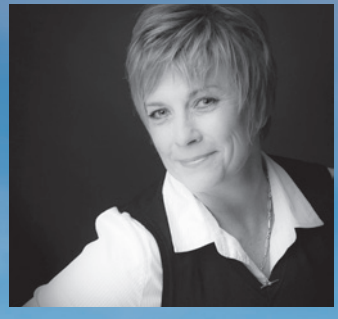
CRYSTAL, WHERE LUXURY IS PERSONAL Wednesday, 27 February at 2:00pm AEST

THE CRYSTAL EXPERIENCE: IN DESTINATION Wednesday, 10 April at 2:00pm AEST