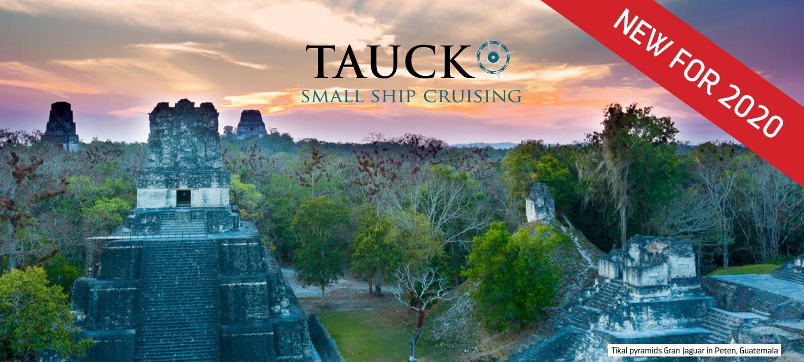
Tikal pyramids Gran Jaguar in Peten, Guatemala