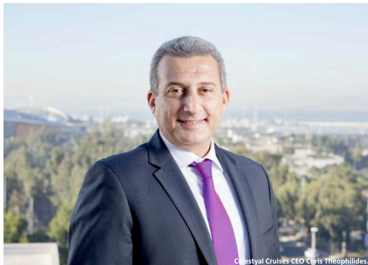
Celestyal Cruises CEO Chris Theophilides.

The restaurant serves classic French seafood dishes with a contemporary twist, with dishes including broiled lobster tail, whole dover sole meuniere, clams au beurre, duck Cassoulet and Salt Crust Baked Branzino.