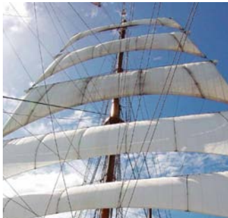
Sea Cloud · Sea Cloud II 2018