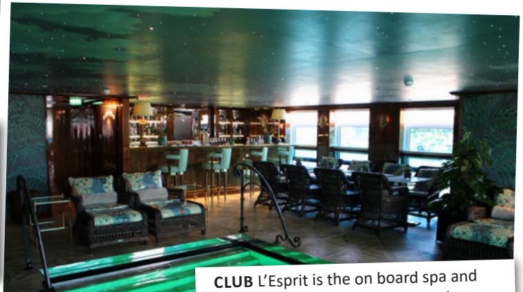
CLUB L'Esprit is the on board spa and wellness centre during the day and at night the pool is covered and the space is transformed into a supper club.