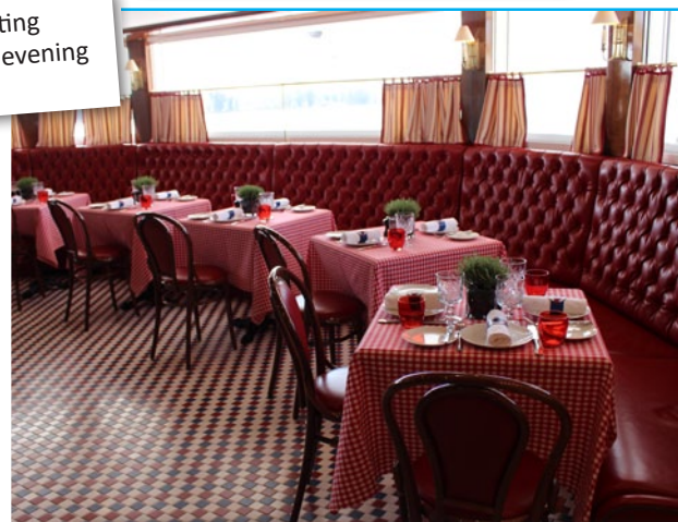
LE BISTROT is a space for an early or late continental breakfast or some light snacks in between meals.