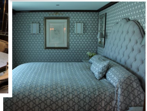
THE bedroom in the Royal Suite.