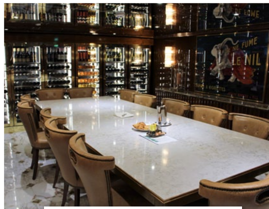
LA CAVE des Vins (the wine cave) is a private dining room for groups on the lower deck.