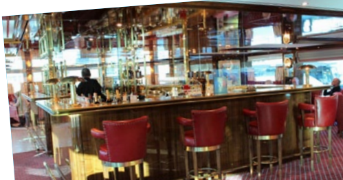
SALON Toulouse is the ship's main meeting space, serving afternoon tea and hosting evening cocktail receptions.