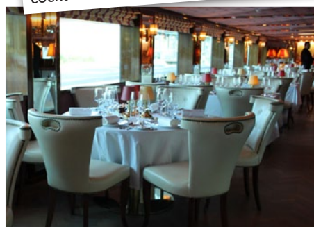
RESTAURANT la Pigalle serves a sumptuous breakfast and lunch and an extensive set menu for dinner.