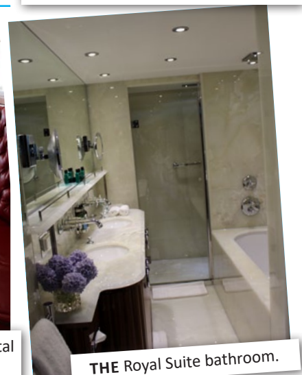
THE Royal Suite bathroom.