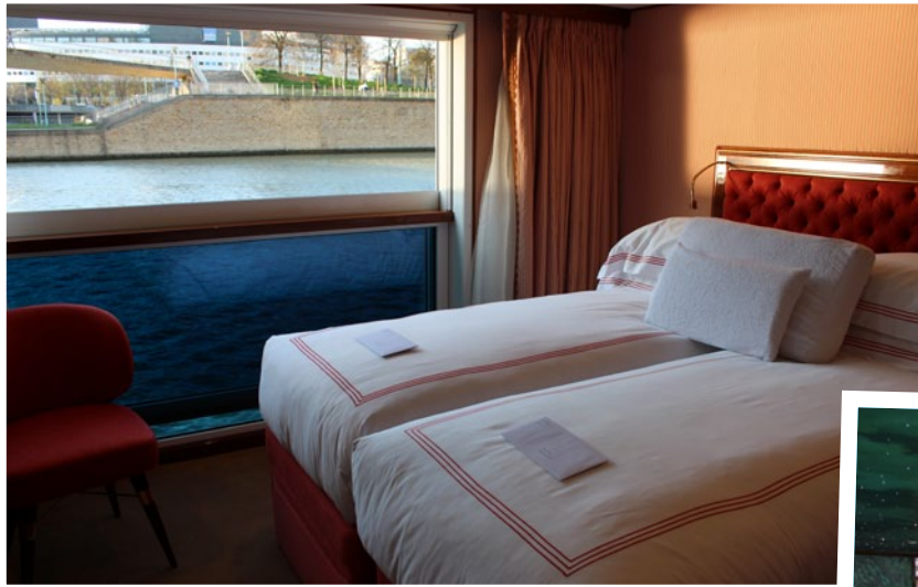
THE staterooms come equipped with a full-sized window which lowers to create a balcony.