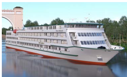
The proposed new MS Volga Dream II

To be built in Croatia, Volga Dream II will carry 160 passengers and 69 crew and offer rarely seen features on European river cruises, such as an outside bar and a medical centre